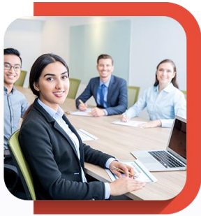
Emerging Technologies Group (ETG)