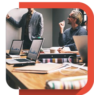
Office Productivity Group (OPG)