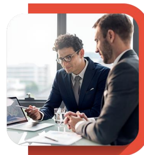
Development Technologies Group (DTG)